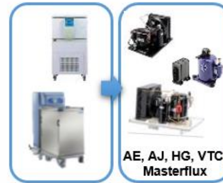
Others: Medical, Specific food